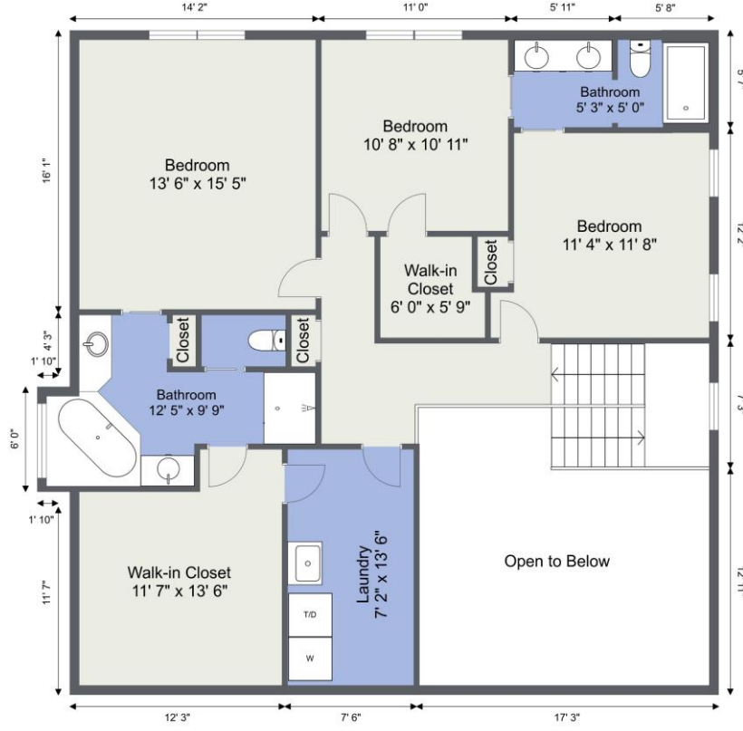
EXTERIOR AREA 1120 SQ FT INTERIOR AREA 1030 SQ FT