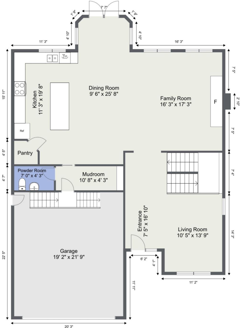
EXTERIOR AREA 1236 SQ FT INTERIOR AREA 1152 SQ FT