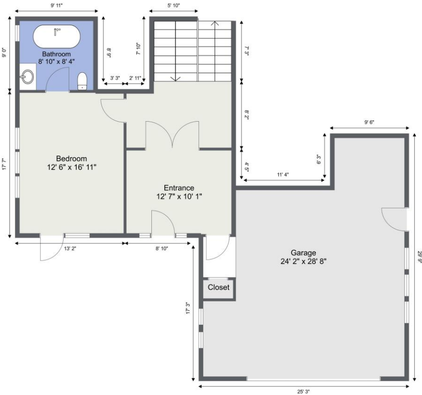
EXTERIOR AREA 610 SQ FT INTERIOR AREA 548 SQ FT