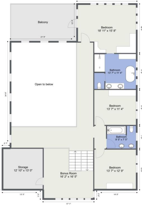
EXTERIOR AREA 1590 SQ FT INTERIOR AREA 1466 SQ FT