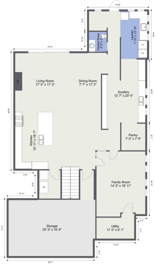
EXTERIOR AREA 2028 SQ FT INTERIOR AREA 1873 SQ FT